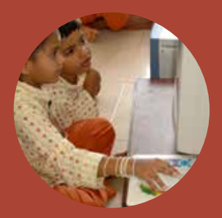
Extensive libraries in print, audio, video with digital classrooms and computer materials